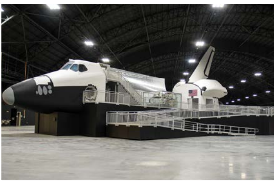
Space Shuttle Exhibit in the new 4th Bldg. at the National Museum of the U.S. Air Force

PROMOTE increased awareness around federal initiatives and new missions that will support the community impact of the Dayton VA Medical Center, the National VA Archives, and the National Museum of the United States Air Force, the Department of Veterans Affairs, Dayton Aviation Heritage National Historical Park and the National Heritage Area.