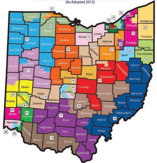
Ohio Senate Districts 2012-2022 (As Adopted 2012)