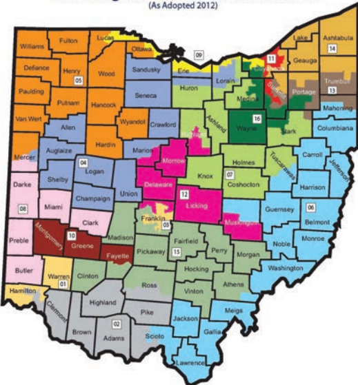
Ohio Congressional Districts 2012-2022 (As Adopted 2012)