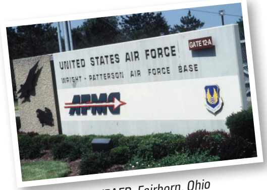
WPAFB, Fairborn, Ohio

ADVOCATE for Base Realignment and Closure (BRAC) initiatives that bolster the role of local active duty, reserve and guard bases, particularly through the training and acquisition of new missions to WPAFB and Springfield National Guard Base.