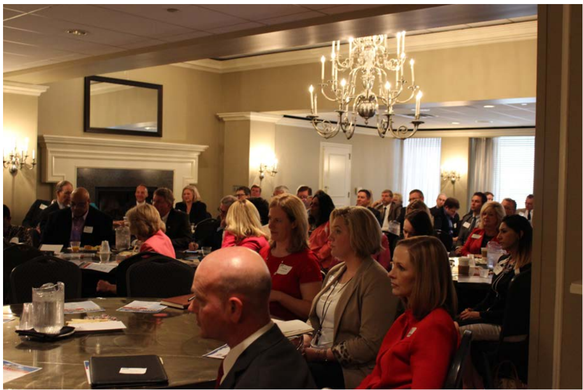
2016 Legislative Day - Capital Club, Columbus, OH