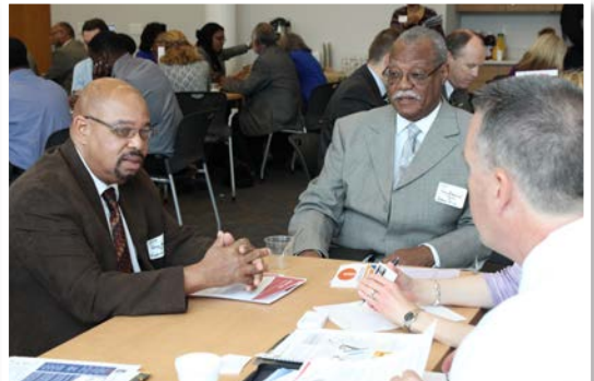
Minority Business Partnership's Business Opportunity Breakfast - Goods/Services & Construction Speed Networking Event