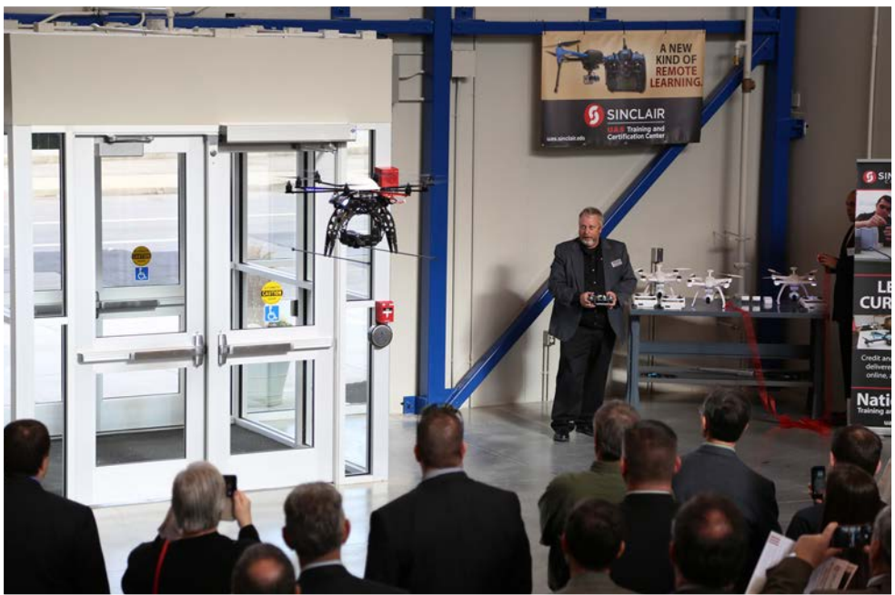
Sinclair College Opens World's First Dedicated UAS Indoor Flying Pavilion