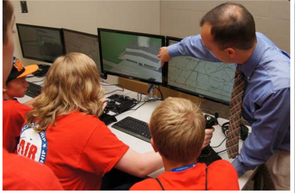
Air Camp at Wright State University

REPRESENT the "employer voice" in local, state & federal workforce efforts, communicate employer needs to education providers and collaborate with institutions and agencies that are doing the best job of meeting the demand for skilled labor.