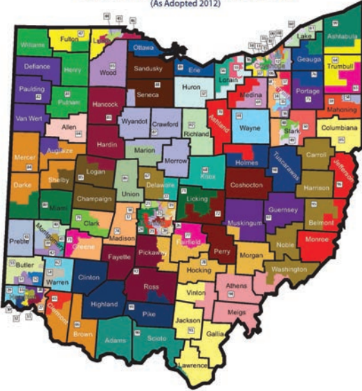
Ohio House Districts 2012-2022 (As Adopted 2012)