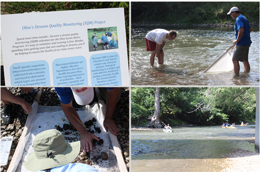
Legislative Paddle & Ohio's Stream Quality Monitoring Project - Little Miami River

SUPPORT a business-friendly, proactive & efficient utility infrastructure system, including gas, electric, water/ wastewater, telecommunications, cable, fiber & Intranet which will enhance business operations and spur economic development.