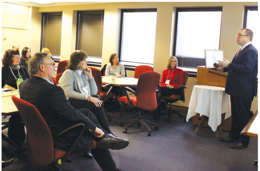
Breakout sessions focused on everything from the emergence of drones in the logistics industry to best practices used at Wright-Patterson Air Force Base.

Nearly 200 attendees took part in the first ever Southwest Ohio Logistics Conference on January 27, 2016.