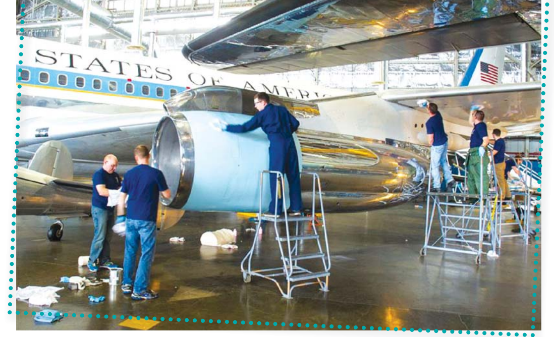
Members of the 89th Airlift Wing from Joint Base Andrews clean and polish historic presidential aircraft in the museum's collection on January 13-15, 2016. The work is being done in preparation for the aircraft to move to the museum's new fourth building, which opens June 8th.

The foundation was established in 1960 and, in fact, largely built the museum. "They paid for 94 percent of the