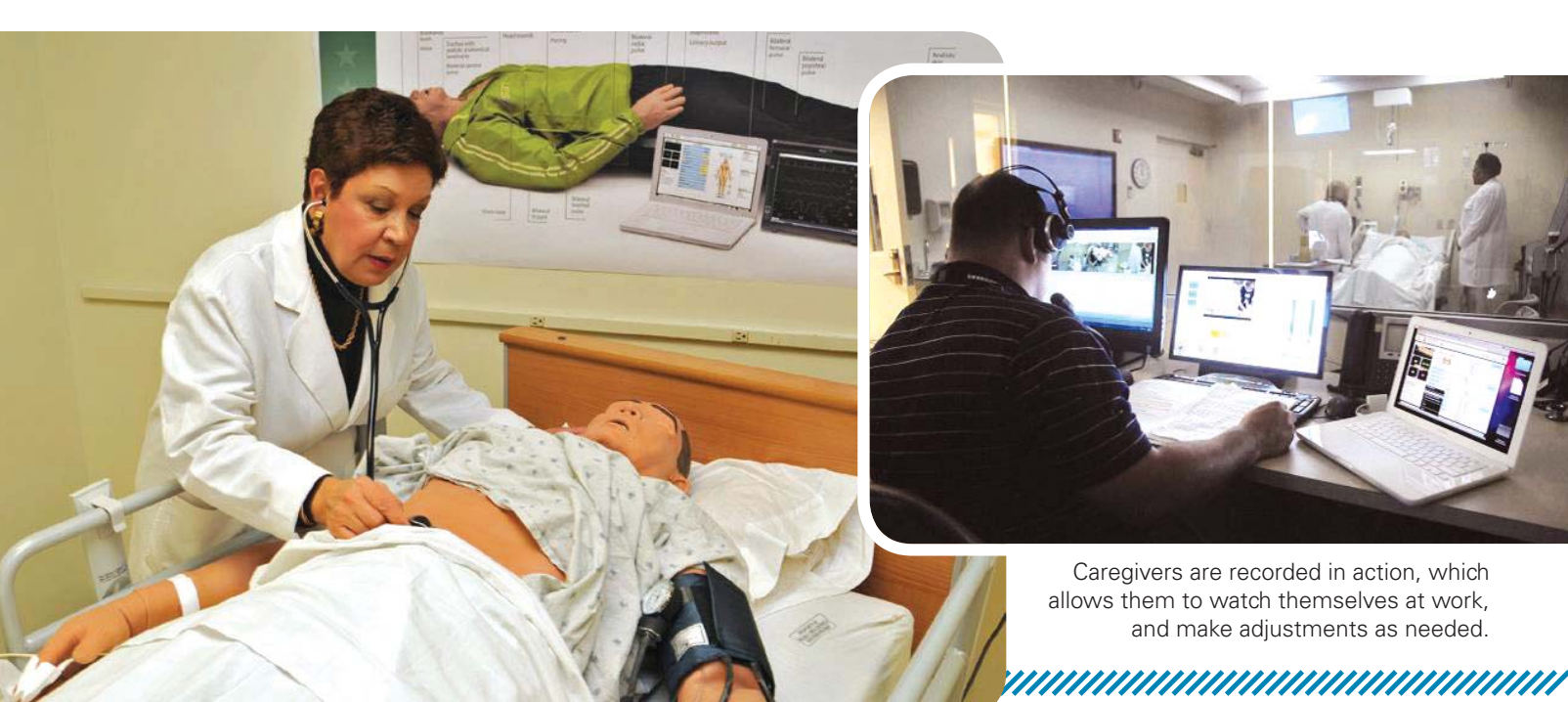
The medical staff at the Dayton VA have access to state-of-the art simulation technology, giving them the ability to learn new techniques without risking patient well-being.

he Dayton VA Medical Center recently unveiled its new state-of-the art simulation center – a 17,000 square foot facility dedicated to providing the VA medical staff with a unique and innovative learning environment.