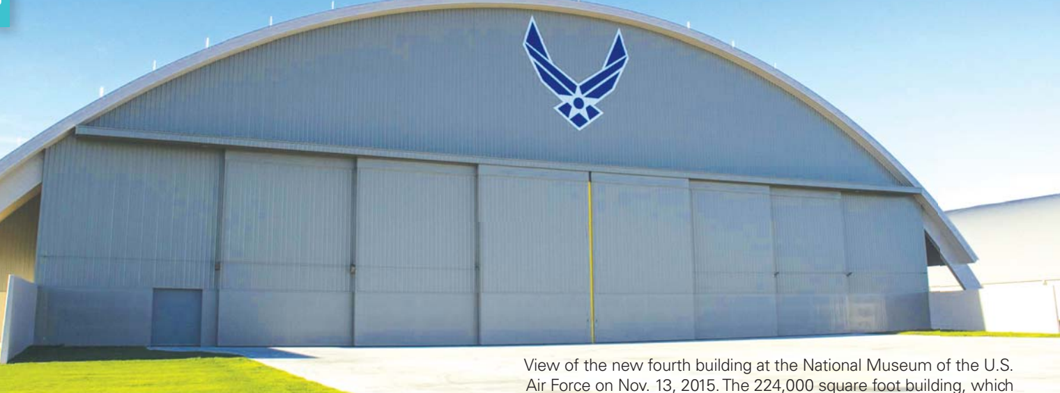
By: Vince McKelvey, Focus Contributor

t the National Museum of the U.S. Air Force, it was not unusual for visitors to head straight to the Presidential Gallery desk the minute the museum opened. That very popular gallery holds 10 presidential aircraft going back to the very first -FDR's 'Sacred Cow' – but it has been located in a building off-site, accessible only by shuttle.