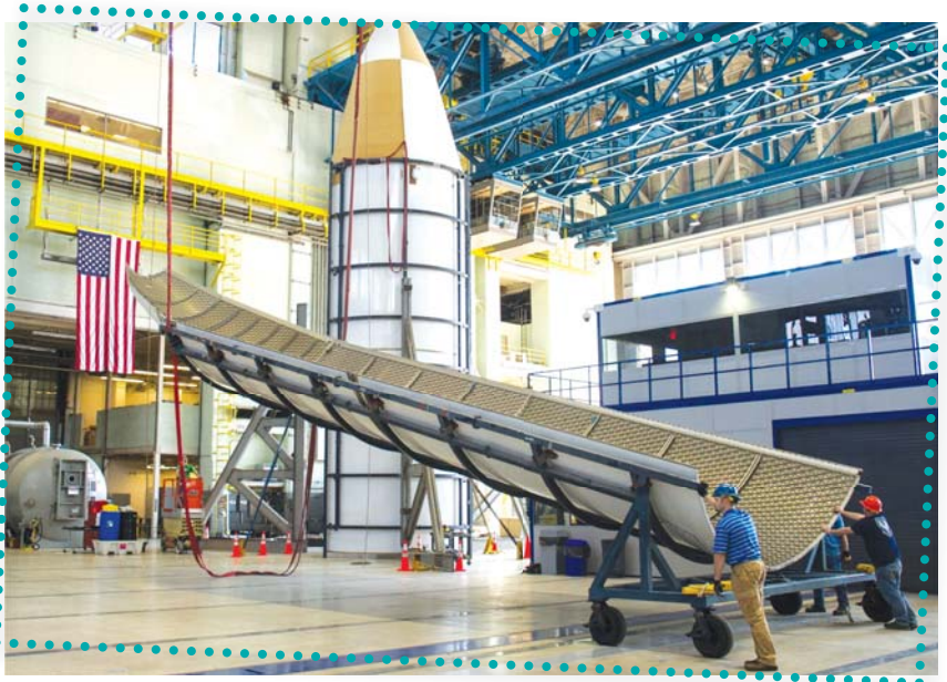
Air Force Research Laboratory engineers and technicians from the Structural Validation Branch of the Aerospace Vehicles Division, Aerospace Systems Directorate, partnered with museum restoration crews to assemble a 60 foot tall payload fairing from the Titan IVB space launch vehicle Feb. 29-March 2, 2016.